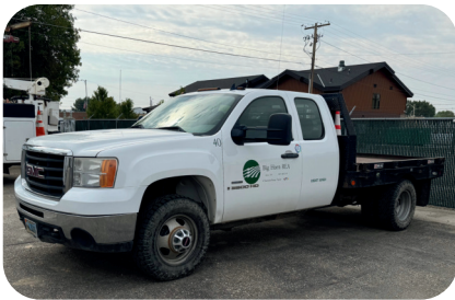
#1 2008 GMC Duramax with Flatbed. Motor is bad. Doesn't run. 126,270 miles.

All bids are subject to the terms and conditions of the Sale of Surplus Equipment. Bids must be received in the Basin office, PO Box 270, 415 South Street, Basin, WY 82410, in a sealed envelope clearly marked "SURPLUS EQUIPMENT SEALED BID." Bids must be received no later than 1:00 pm on September 20th. Big Horn REA reserves the right to accept or reject any bid.