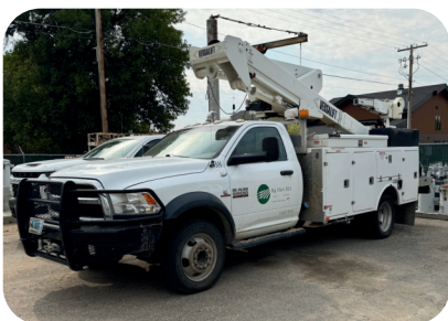
#2 2014 Dodge 5500 with a VST 40I Bucket Truck. Had new motor installed by DPS in Worland @ 139,460 miles. Bucket works as should. 151,220 miles.