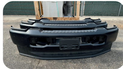
#4 3 Ford bumpers, front is a 2025, back two are 2022. some hardware, no tow hooks.