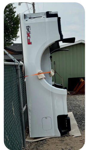
#7 New take off. 2022 Ford long box complete with bumper, lights, and receiver hitch. Rear camera was taken off.