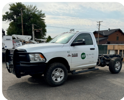
#5 2017 Dodge 3500 with cab chassis. Has all the wiring for flatbed or new box (not included). 111,789 miles.