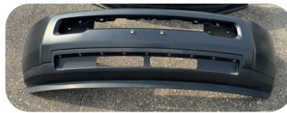
#3 2020 Dodge bumper only.